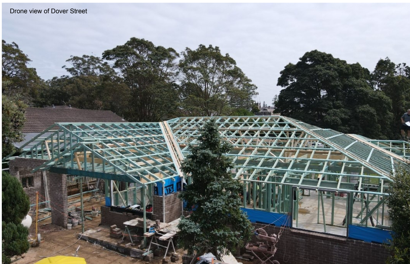
Drone view of Dover Street